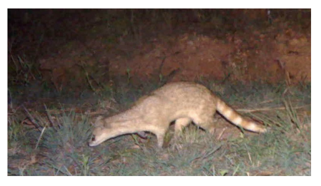
Fig. 2. A Small Indian Civet Viverricula indica with a brown coat colour aberration. The animal was camera-trapped on 7 October 2015 at 23h40 in Chamundi Hills Reserved Forest, Karnataka state, southern India.

IUCN SSC Small Carnivore Specialist Group