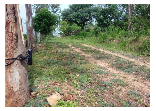
Fig. 3. The habitat of the camera-trap location where the brown Small Indian Civet Viverricula indica was camera-trapped on 7 October 2015 in Chamundi Hills Reserved Forest, Karnataka state, southern India. The fence marking the boundary of the protected area is visible at the left.

We are thankful to the Karnataka Forest Department for granting us permission to conduct the research work. We are also thankful to all the staff of Chamundi Hill Reserved Forest for their help and support provided during our fieldwork. We are especially grateful to the two reviewers who enriched this manuscript with their valuable feedback. We are grateful to the field staff for help during our research work.