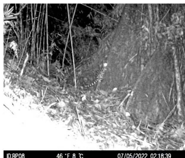
Fig. 2. Camera-trap photo of the Spotted Linsang Prionodon pardicolor recorded on 7 May 2022 at 02h18.