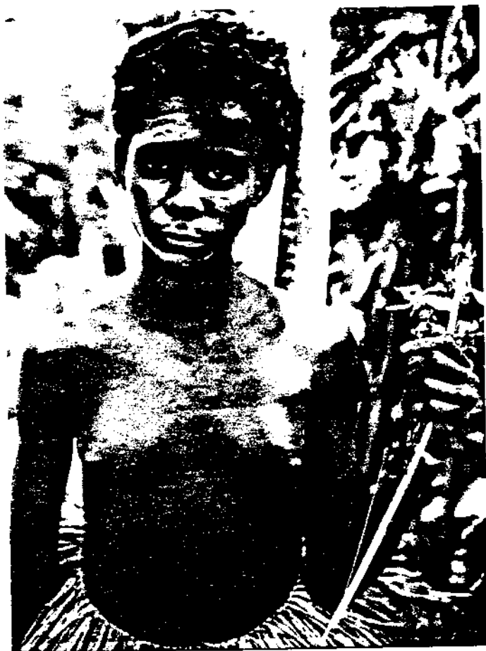
Fig.2. Mbuti girl wearing a hat made from Genetta skin.

behaviour; the latter is killed with every kind of arrow (simple wooden, poisoned, and iron-tipped) when resting in trees.