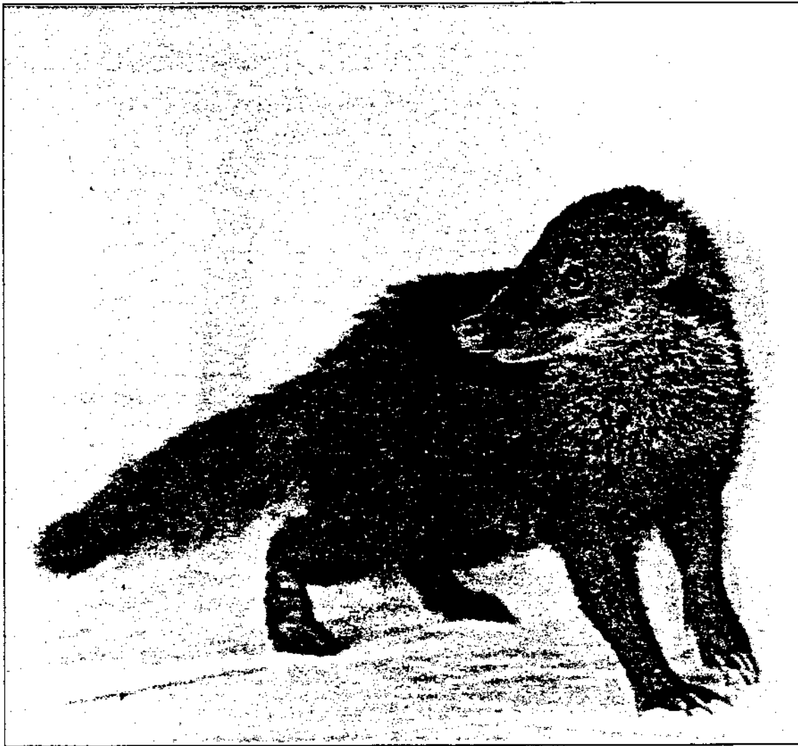
Liberian mongoose ( Liberiictis kuhni). First photograph taken of a live animal.