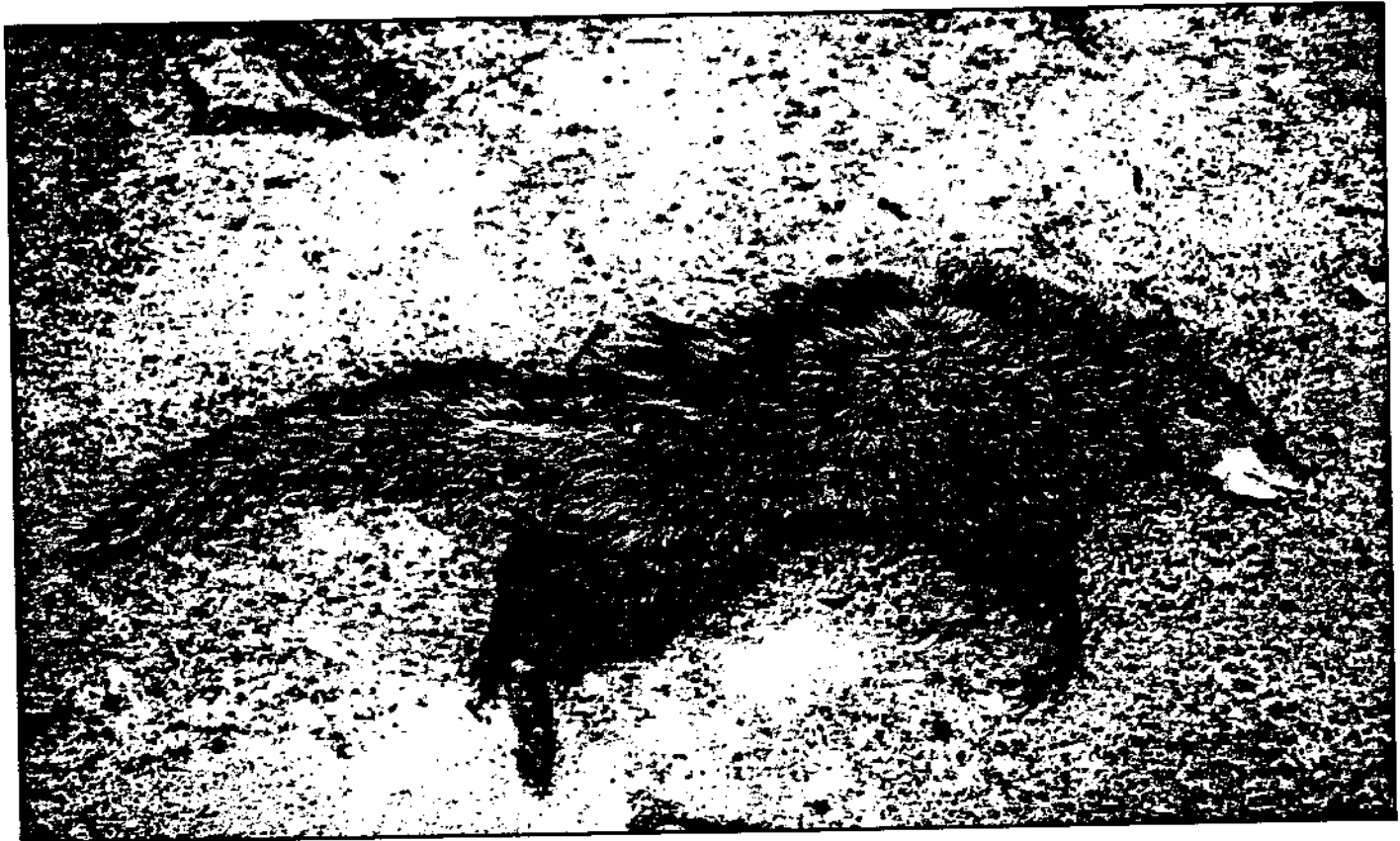
Fig.1. Alexander's cusimanse ( Crossarchus alexandri )

The African civet ( Civettictis civetta ) and the two-spotted palm civet ( Nandinia binotata ) are often caught and eaten by the Mbuti. The former is easily captured with nets for antelopes because of its large size and terrestrial